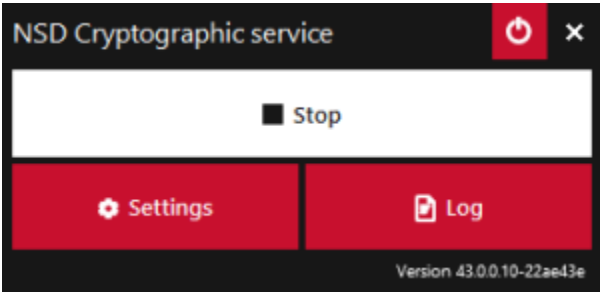
Figure 2 – Stop button

To stop Cryptographic service, click the Stop button.