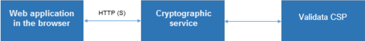
Scheme 1 – components

Permitted processes are granted access to the Validata CSP for performing encryption.